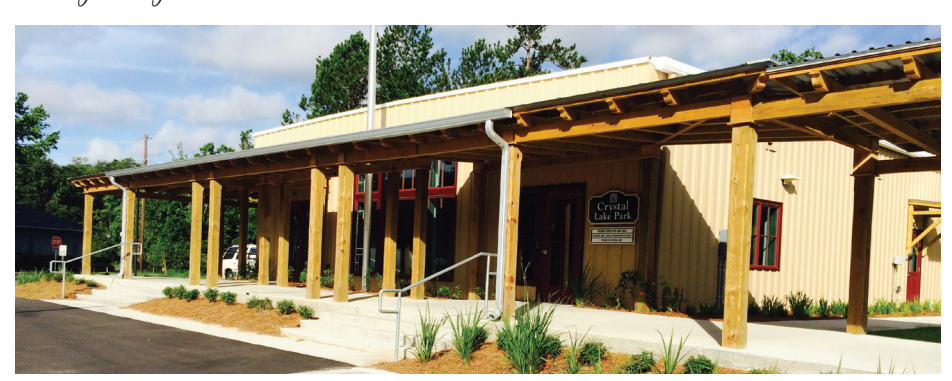
Moving to the new office located at 124 Lady's Island Drive on June 12, 2017.