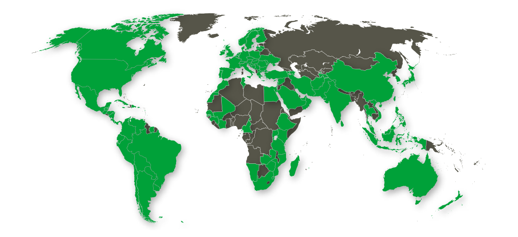
PRODUCERS WORLDWIDE UNDER CERTIFICATION: 112,600 IN 112 COUNTRIES

And it means that consumers can be assured of food safety and the fundamentals of how their food is produced.